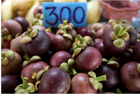
The flavor of the tropical—and difficult to find—mangosteen has been described as a delicious mix of lychee, peach, strawberry, and pineapple.